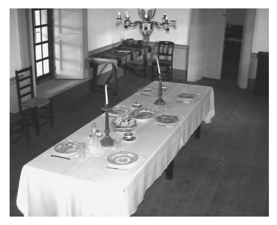
Figure 4 Reconstructed Vallejo family dining room, Petaluma Adobe State Historic Park, California.

ground plan. For instance, the original ground surface had been shaved off to flatten the promontory, and workers had placed the removed fill against sturdy cobble retaining walls, which served as foundations, to raise the adjoining slopes of the now-flattened hill to increase the surface area to raise the building (Silliman, 1999: 111–17). Sitting on top of that ground surface, below the accumulation of fill to raise the surface to grade level, was one red-on-white glass bead. Although only a single example, the bead drew a sharp parallel to the more than 1300 glass beads – many of them red-on-white – recovered from the nearby Native living area (Silliman, 2004: 143–8). This single bead served as a fleeting material reminder of Native American laborers and their toils, but its message was made possible by connections outside of the shared space inside the adobe walls, where such items had been found in worker residential areas.