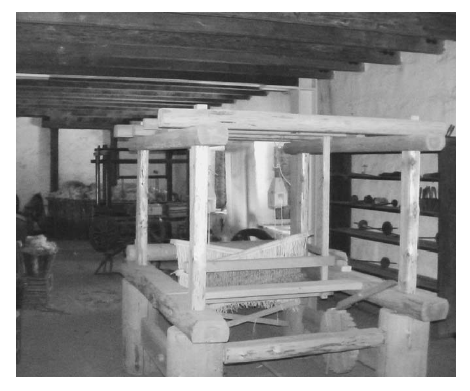
Figure 3 Reconstructed ground-floor weaving work room, Petaluma Adobe State Historic Park, California.

much like the earlier example of creamware-dominated households in southern New England and some Spanish colonial households in La Florida . Such a realization means that Native 'domestics' handled, washed, and used the same material items. Having these material items only in 'eating' or 'display' mode, thereby implicitly assigning them to owners, truncates the richness of their material biographies. Interestingly, I recovered fragments of such colonial items in trash deposits associated with Native laborers who lived near the adobe house, further highlighting the ambiguity of material culture meanings (Silliman, 2004). In other words, both the Native American worker households and the dominant settler household used some of those same materials (but also very different ones, too, such as obsidian stone tools and shell beads in the Native spaces). The pattern calls into question even classifying these objects to 'culture' since origins cannot capture all possible practices and meanings.