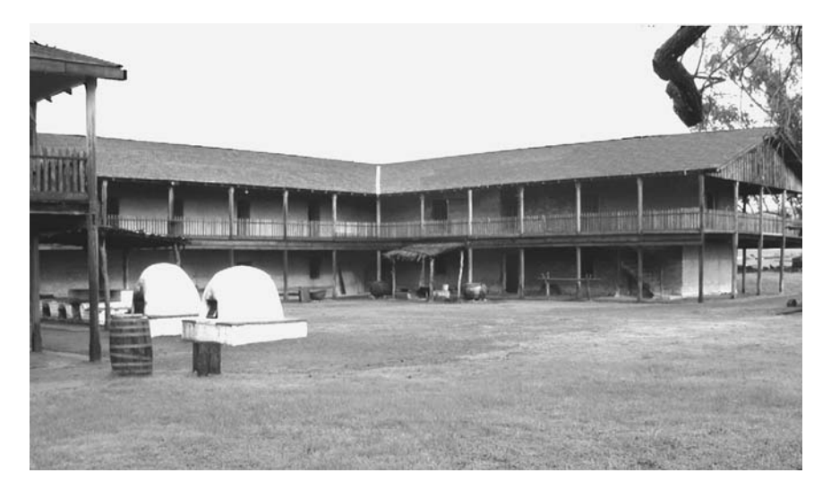
Remaining three-quarters of quadrangle of Petaluma Adobe, Figure 2 Petaluma Adobe State Historic Park, California.

Miwok Native community that it would help to fill those gaps by excavating in a historic Native American living area near the main adobe house.