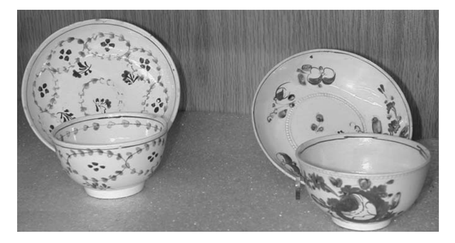
Figure 1 Overglaze handpainted creamware vessels (Mashantucket Pequot Museum and Research Center, Mashantucket, Connecticut).

Creamware, a refined earthenware ceramic produced in England between 1762 and 1820, appears ubiquitously on colonial sites across eastern North America (and far beyond) in the latter quarter of the eighteenth century (Figure 1). Archaeologists consider it a helpful temporal marker as well as a key material signal of British/EuroAmerican culture. To most archaeologists, finding creamware in British/EuroAmerican households rarely surprises since it is considered part and parcel of everyday life for such settlers and colonists. Finding it in Native American households is considered evidence of their participation in European market economies and perhaps culture change. Archaeologists (and the general public) assume that creamware is always already a British, EuroAmerican, or even a more broadly European item, privileging its origins as the key determinant of its seemingly inherent cultural meaning. I have mounted an argument for why this view is flawed for creamware found even in Native